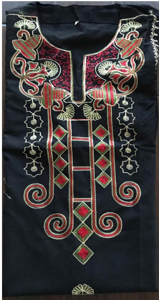
Egyptian Women Galabeya Embroidered With Red and Green Embroidery Women Dress Size M